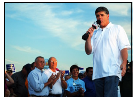
Sean Hannity covering Pacific Legal Foundations fight to turn on the water in the Central Valley

PLF is involved in a legal battle challenging the water cutbacks to the Central Valley and Southern California. The Foundation, established in 1973, fights for limited government, property rights, individual rights and a balanced approach to environmental protection. For more information on PLF. visit their website at www.pacificlegal.org