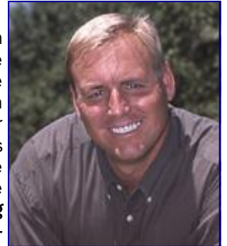
State Senator Jeff Denham

Recalling Jeff Denham and replacing him with Democrat Simon Salinas, will bring the Democrats within one vote of being able to pass a budget and raise taxes without a Republican vote in the State Senate. Notwithstanding is the anti-family legislation they have in mind. Denham's 12th District is a juicy target for the Democrats because there are more registered Democrats (46%) than Republicans (36%). If the recall is successful, there is no doubt that the Democrats will go after the other competitive seat, the one being vacated by Senator McClintock. Winning McClintock's seat will give the Democrats a veto-proof majority!