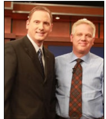
U.S. Senate Candidate, Chuck DeVore (L) with FOX News Favorite, Glenn Beck