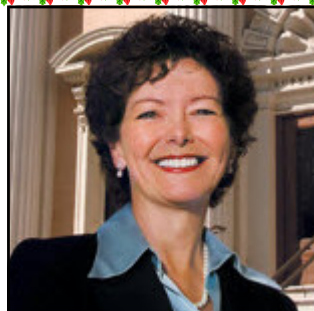
Delores Carr Santa Clara County DA

Check In —9:00 AM — Continental Breakfast 9:30 AM —Meeting called to order 11:00 AM —Meeting Adjourned 14595 Clearview Drive - Los Gatos, CA 95032