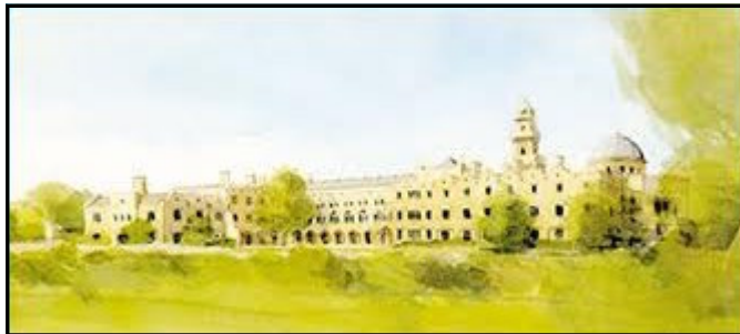
Proposed Mosque and Cemetery for San Martin

The Board of Directors of Silicon Valley Association of Republican Women (SVARW) from time to time receives requests from various groups to address us in order to solicit support on a wide range of topics. Recently, SVARW hosted the "Repeal the Bag Ban" group. As a political club, we strive to provide our members with opportunities to participate in a wide-ranging variety of local political causes and movements. As a group we have participated in Tea Party rallies, voter registration drives, the Conservative Forum, and candidate support. We host speakers monthly on a variety of topics ranging from Constitutional rights to issues that are both deeply personal and uniquely local.