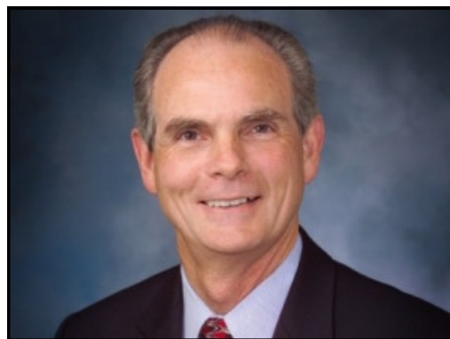
San Jose Mayor Chuck Reed

Purchase tickets online at www.SVARW.com