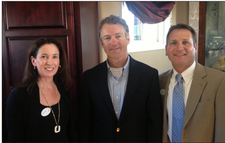
Jane Kearney, Sen. Rand Paul and Joe Kearney

Paul presents as a sincere, thoughtful and serious patriot, speaking easily without notes on constitutional principles, current abuses of liberty, privacy and the need for a restrained federal government. Paul advocated common sense measures such as having a federal budget that reflects living within our means. He recently introduced a bill requiring legislators to read bills before signing them. Included is a clause requiring the allotment of one day of reading time for each 20 pages of legislation proposed, as a means to stop the ramming through of laws without time for proper consideration.