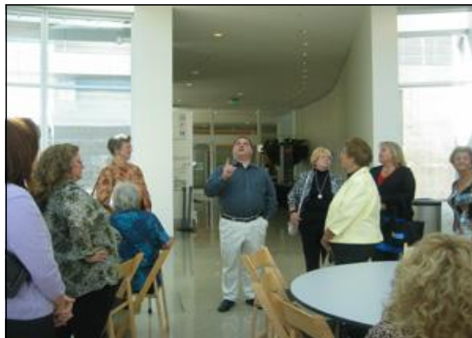
Tour begins in Rotunda of San Jose City Hall