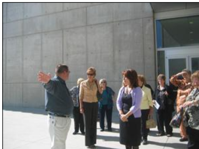
Walking to Tower where City Council Offices are located.