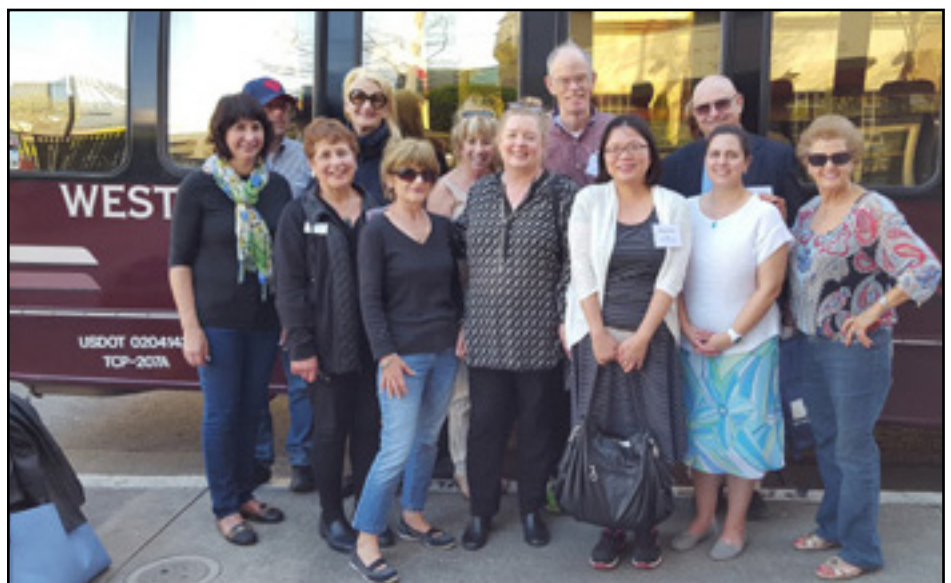
Members of SVARW prepare to return from Lobby Day in Sacramento last month.