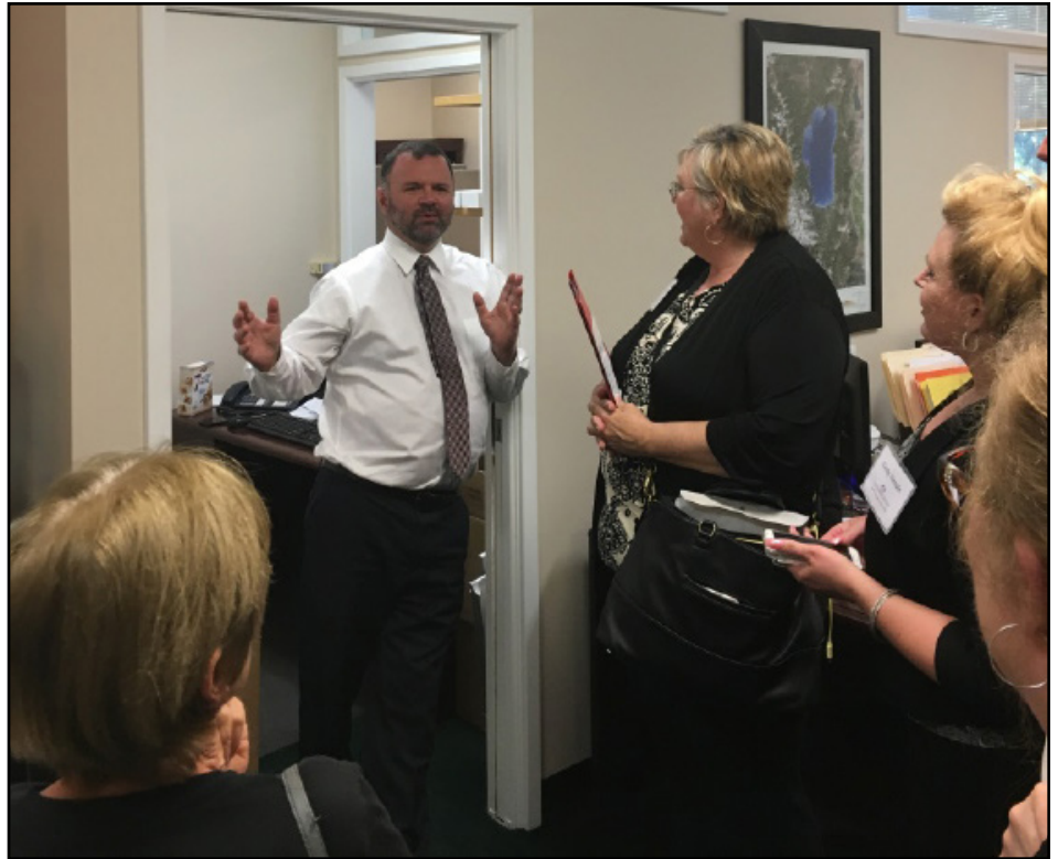
Voters meet in the office of a Sacramento legislator during Lobby Day on March 14.