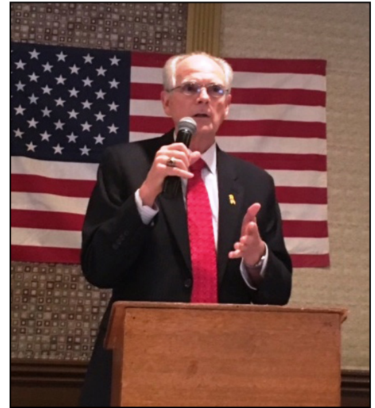
Former San Jose Mayor Chuck Reed speaks to SVARW members on April 19.

Find out more about efforts around the nation to resolve pension funding at retirementsecurityinitiative.org